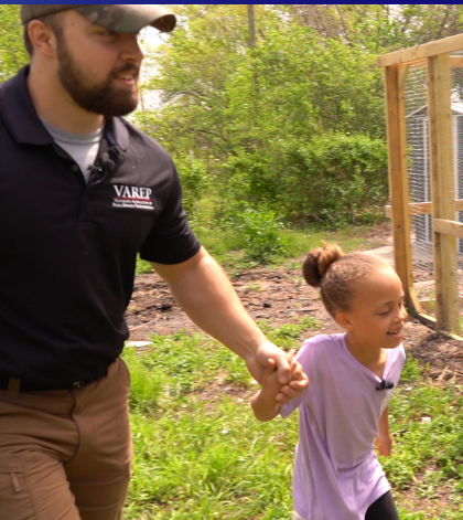
U.S. Air Force

Use your camera on your smart phone to scan the QR code below to watch more success stories.