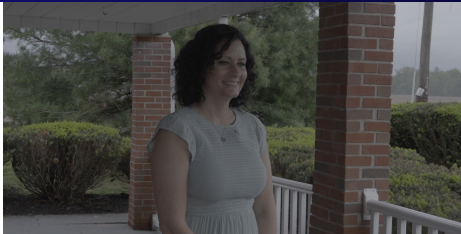
U.S. Army Veteran