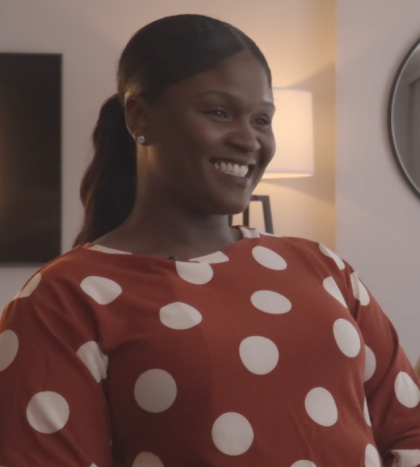
U.S. Army Veteran

Use your camera on your smart phone to scan the QR code below to watch more success stories.